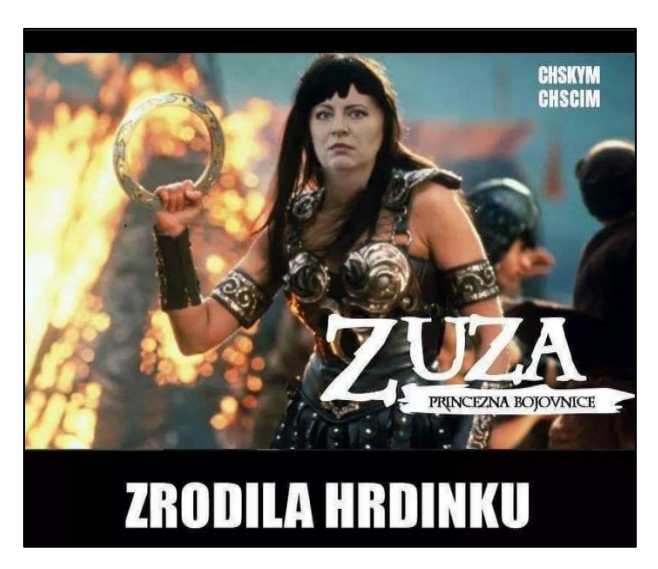
Figure 1. Slovak president Zuzana Caputova as Xena, the warrior princess<sup>1</sup>

The interpretation within a wider intertextual field, on the other hand, allows readers with higher meme literacy to decode socio-cultural meanings based on a pop cultural reading of the content of the TV show. This manner of reading then reveals: the similarity of facial features between Caputova and Lucy Lawless, the actress who portrayed Xena; the status of Xena, who travelled the world and fought stronger opponents many times alone, creating a metaphor for Caputova's rise to popularity during election debates, when she had to face more favoured male opponents; the reinforcement of Caputova's positive public image as a protector or, even, a saviour of the country, through textual elements of the meme stating: "bore a she-hero", which is an excerpt from the Czech translation of the show's narrated intro. The original English version goes as follows: "In a time of ancient gods, warlords, and king // A land in turnoil cried out for a hero // She was Xena, a mighty princess forged in the heat of battle // The power, the passion, the danger // Her courage will change the world."